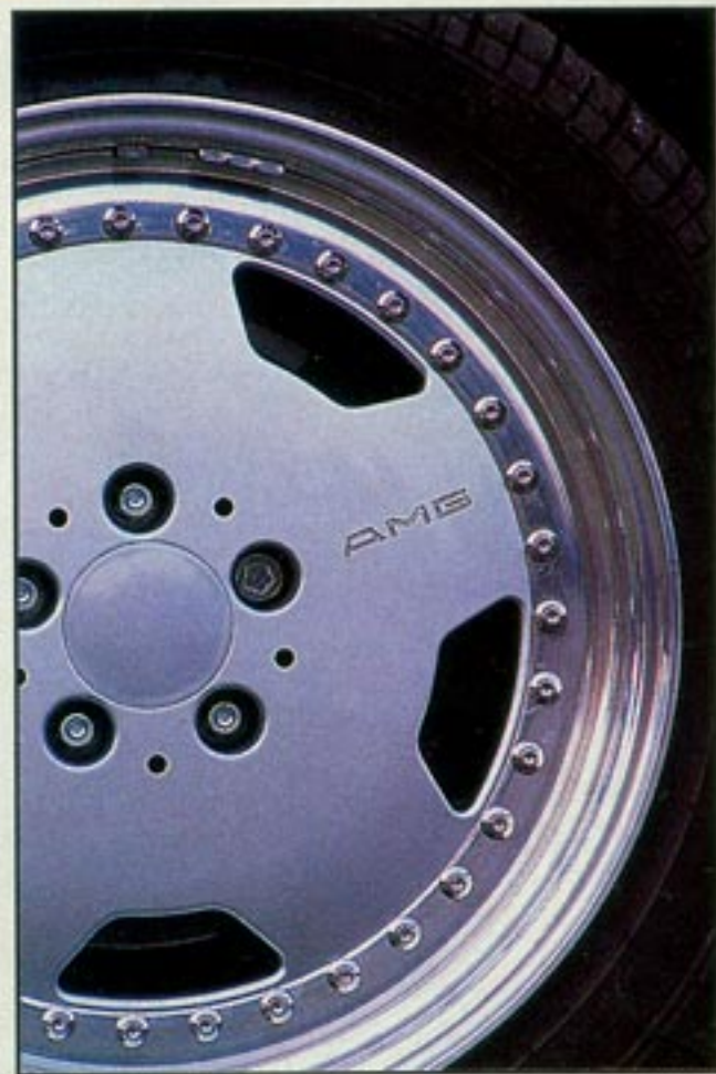
Though the V-8 has been pumped up to six liters, the engine "looks" stock. Wallet alert: aluminum wheels cost $1300 each.