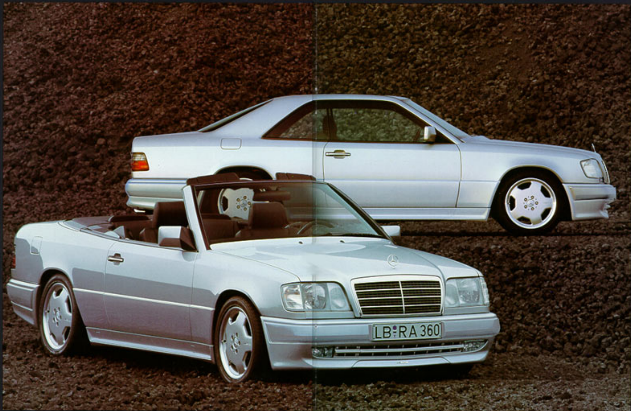
The elegant Mercedes cabriolet acquires a sporting profile with its AMG wheels and the styling package, all in bodywork colour