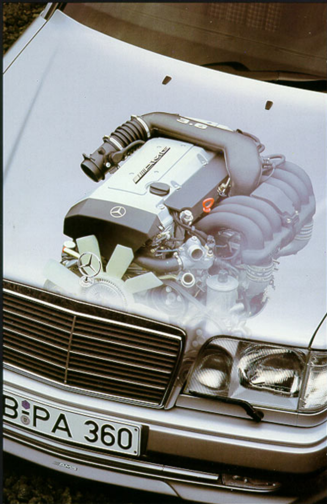
For the E-class cabriolet, coupé and T-series models, the refined power of a six-cylinder engine with 3.6 litre displacement and an output of 200 kW (272 hp) is available from AMG