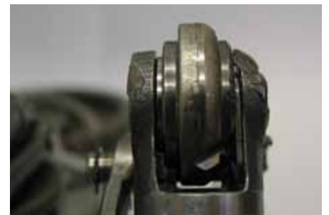
Damage: one-sided wear on the cam roller

! The assembly basket (3) must not be installed again after a new vacuum pump is installed.