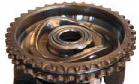
Worn cam disk