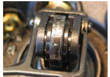
Damage: Cam roller with pittings due to worn cam disk.

! The assembly basket (3) must not be installed again after a new vacuum pump is installed.