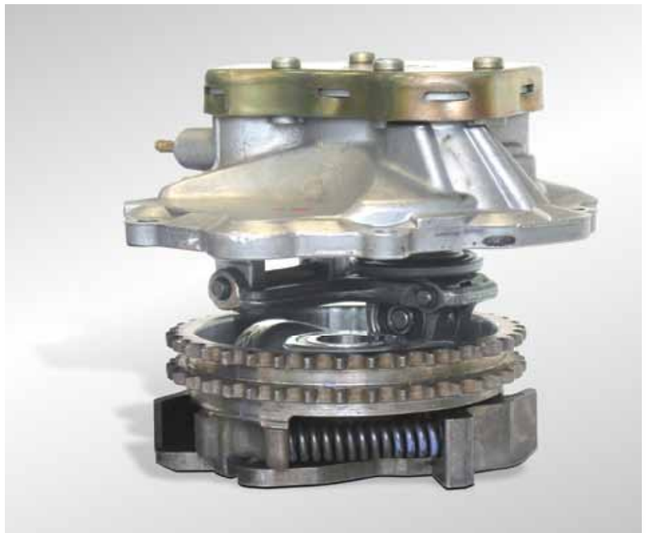
Vacuum pumps in series 7.20607... (top) on the injection timing mechanism

Until around the mid-1990s, the cam disk on the injection timing mechanism could be replaced separately. Today, the injection timing mechanism can only be replaced complete with the cam disk.