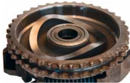
Immaculate cam disk

The cam disk should be sent in to enable complaints to be assessed.