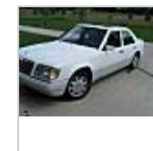
Mercedes-Benz : E-Class