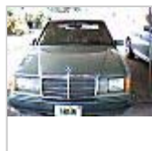
Mercedes-Benz : E-Class