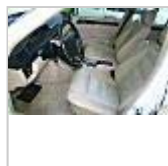
Mercedes-Benz : E-Class