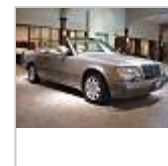
Mercedes-Benz : E-Class