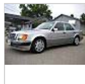
Mercedes-Benz : E-Class