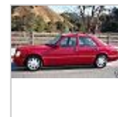
Mercedes-Benz : E-Class