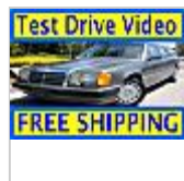
Mercedes-Benz : E-Class