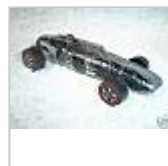
VERY RARE EARLY PROTOTYPE HOT ...