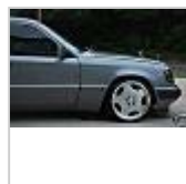
Mercedes-Benz : E-Class