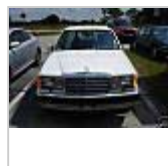
Mercedes-Benz : E-Class