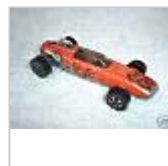
VERY RARE EARLY PROTOTYPE HOT ...