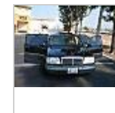
Mercedes-Benz : E-Class