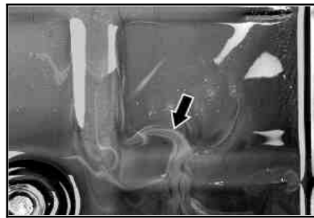
Figure 2 P27.00-2028-01

Review S.I. MBNA 27/32, dated May 1998 concerning ATF fluid color as well.