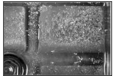
Figure 3 P27.00-2029-01

Extremely fine graphite like abrasion particles Mechanical damage to transmission